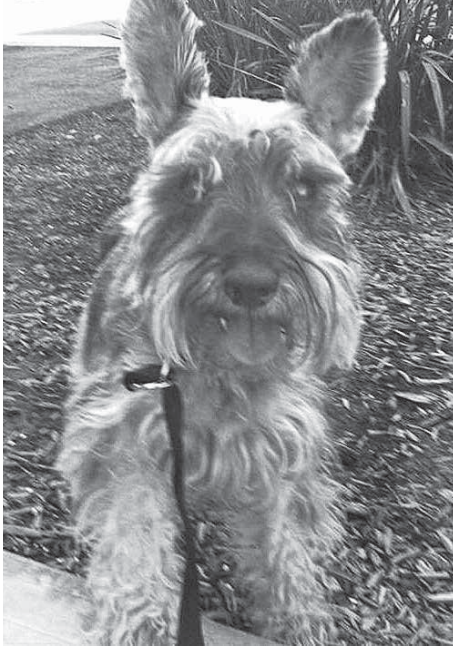
Harmony loves people and would like to be their only dog.

I am a very affectionate nine-year old, people-loving, female Miniature Schnauzer. After spending my whole life being a loyal, loving companion, my previous owner rewarded me by dumping me at a kill shelter. I was discarded like a bag of trash and am so grateful that the MSFR folks rescued me. They took me to their vet because my teeth were terrible and most had to be extracted. The vet also discovered that I have some high liver levels, so now I'm on a low-fat diet that will get me back on track and keep me at my current weight of 17 pounds. Although I am tolerant of other dogs, I would prefer being an only dog." If you are interested in Harmony, please email info@msfr.org for more information.