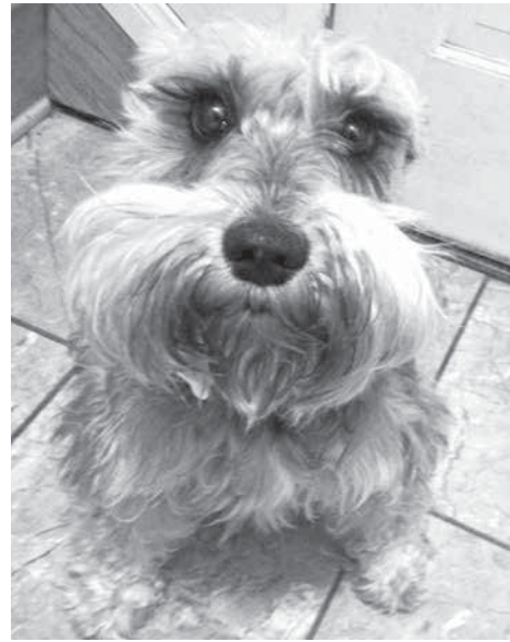
Gretchen is a mini-Schnauzer who misses having a family.

well-socialized lady who enjoys the company of both dogs and people. I have many years of love to give and would be a great companion if you'll just give me a chance." If you are interested in Gretchen, please email info@msfr.org for more information.