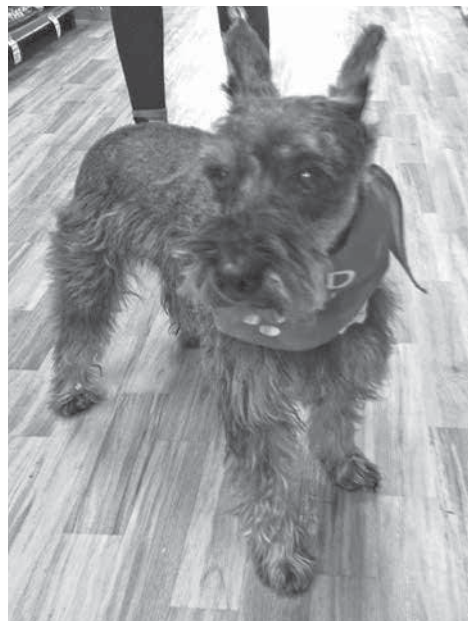
JJ is very handsome and would love walking with a new owner.

with my makeover. I would like to lose a few pounds with my current weight being 24 pounds. However, I'm a happy,