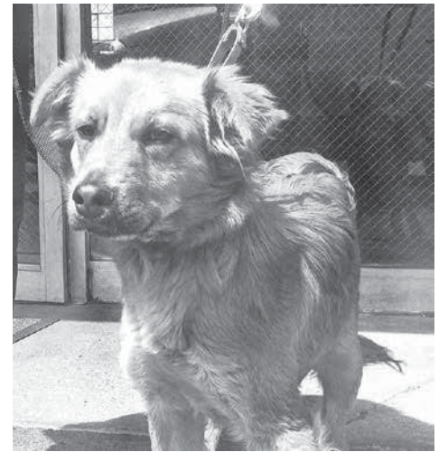
Harvey is a sweet Golden Retriever who plays well with others.

"They call me Harvey even though I'm not a six-foot rabbit. I am, however, a two-year old, male Golden Retriever mix who was rescued from the Lancaster Shelter. I'm 35 pounds of happiness and fun. I get along great with other dogs, have a sweet disposition and I love people." Harvey can be seen anytime at Yellow Brick Road Doggie Playcare in El Segundo. Call 310-606-5507. •